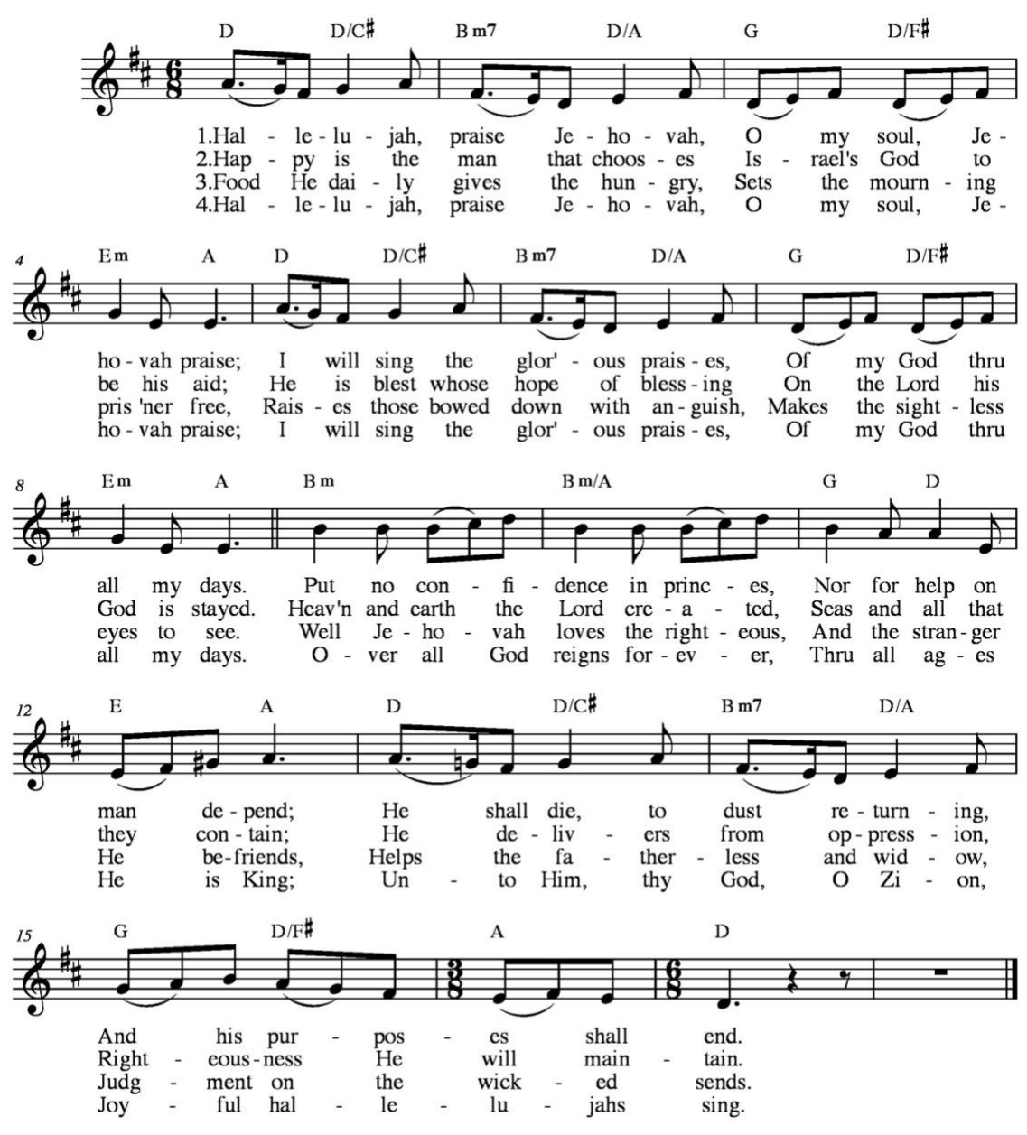
© 1982 Darwin Jordan Music. Used by permission. All rights reserved.